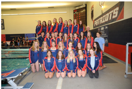
The CB East girls' swim team

Despite this exciting occasion, the swim team still has a lot of work to do, including going against sister schools Central Bucks West and Central Bucks South. Multiple swimmers are also working towards district qualifying times.