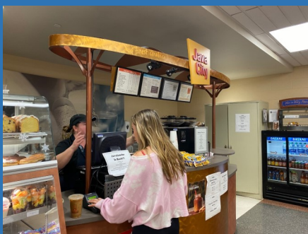
Students love to order coffee and snacks from Java City to start the day off right.