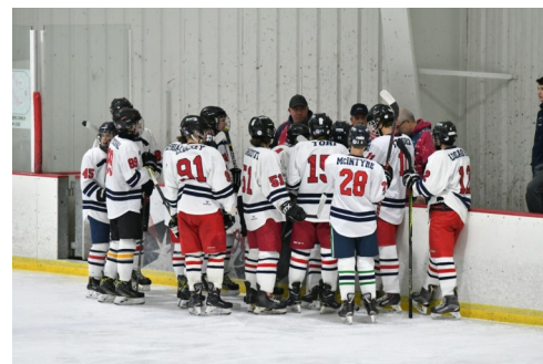
The team gathers after the first period to talk over the game plan.